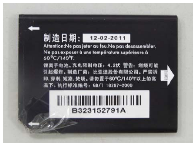
b: Battery 1