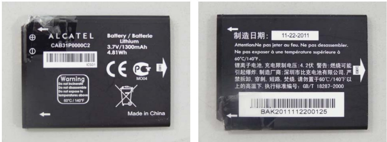
c: Battery 2