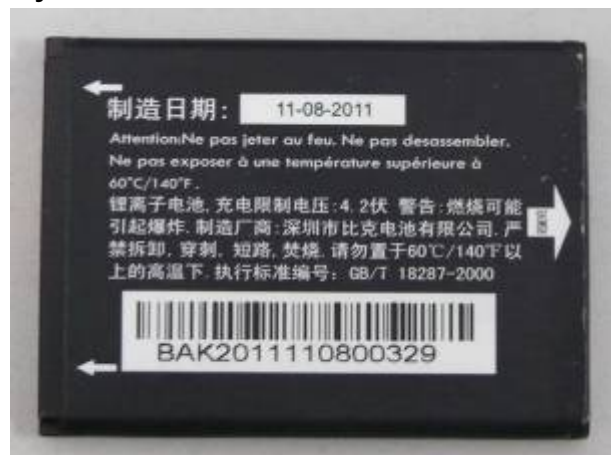
c: Battery 2