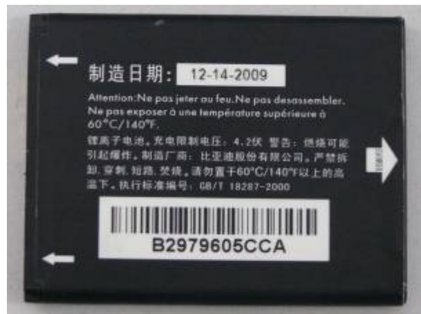
b: Battery 1