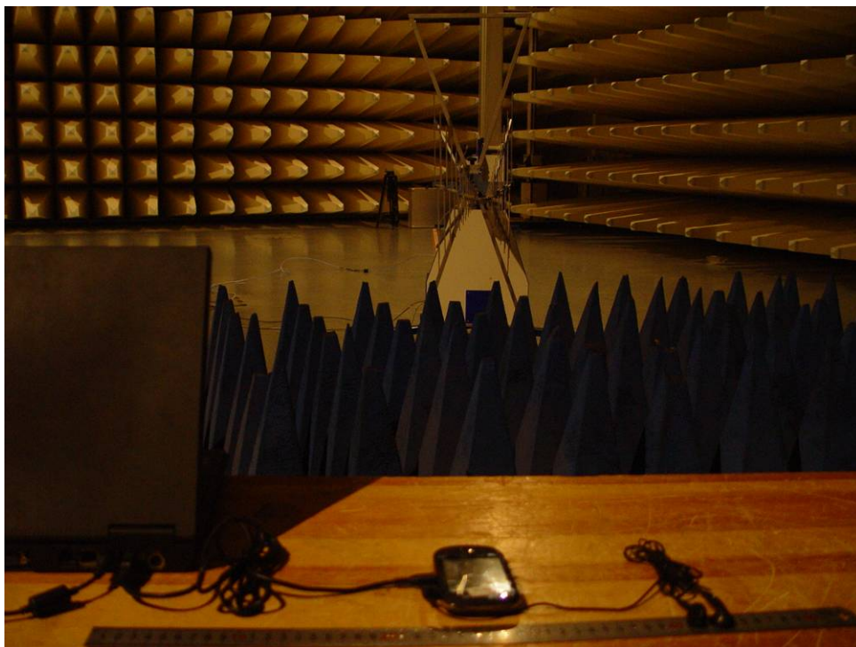
Radiated Emissions Test Setup