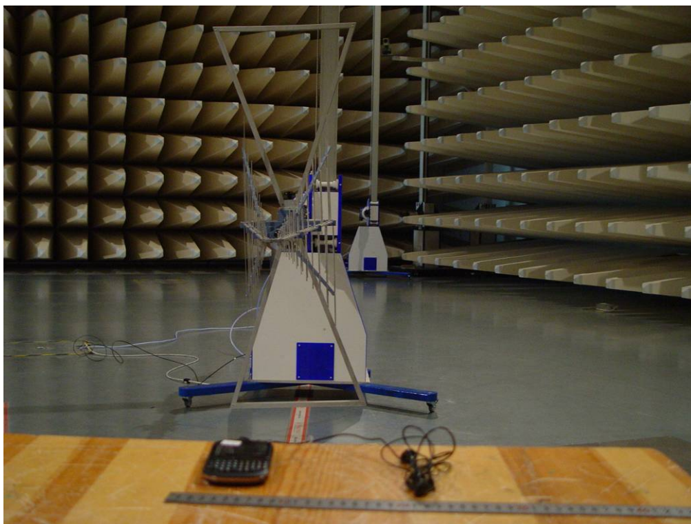
Radiated Emissions Test Setup