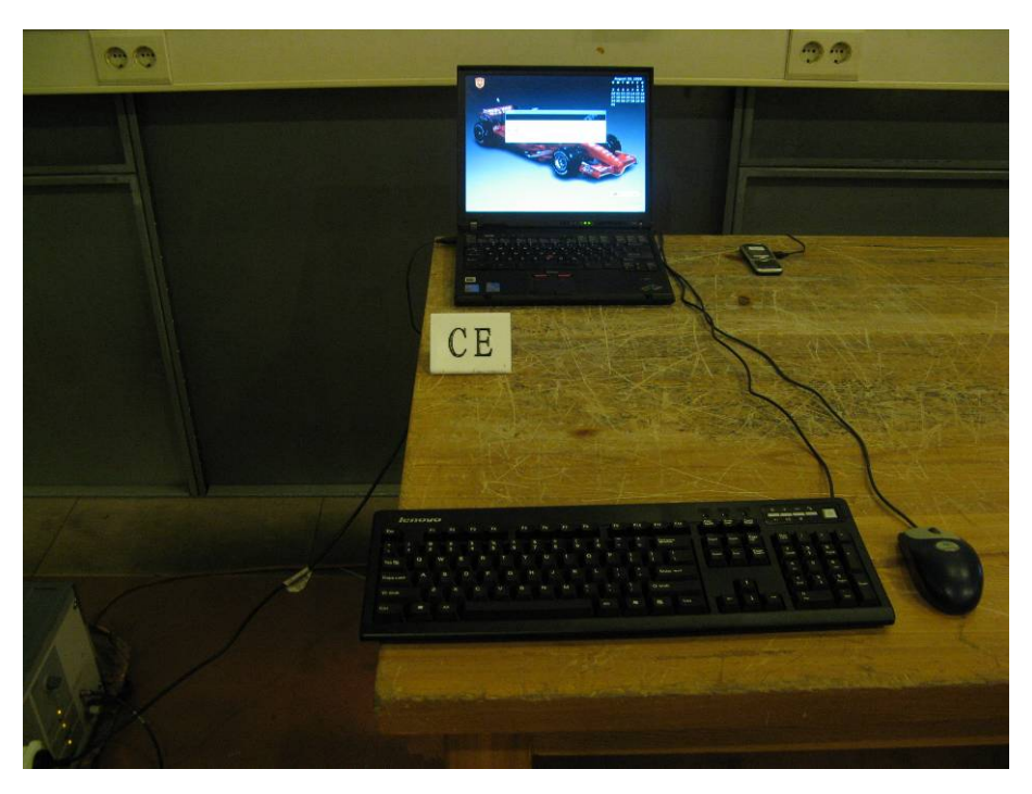
Pic 2 Conducted Emission with laptop