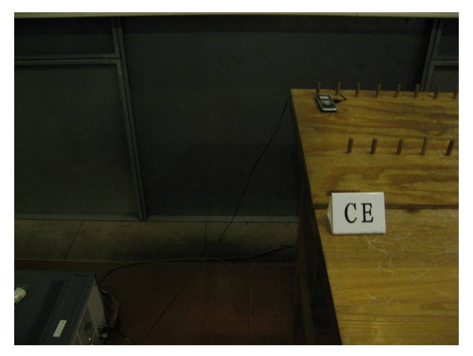
Pic 1 Conducted Emission with charger