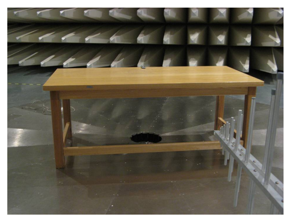
Pic 5 Radiated Spurious Emission Part 15C