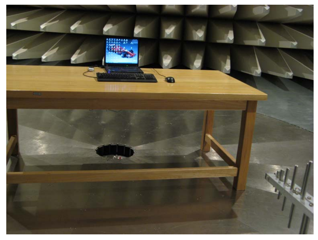
Pic 2 Radiated Spurious Emission for Part 15B