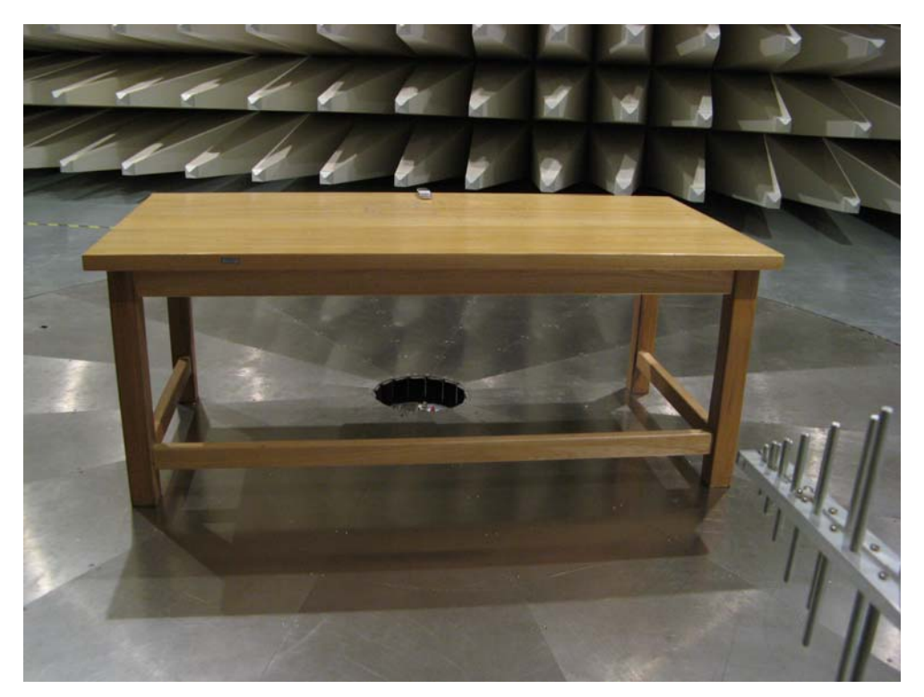
Pic 3 Radiated Spurious Emission for Part 15C