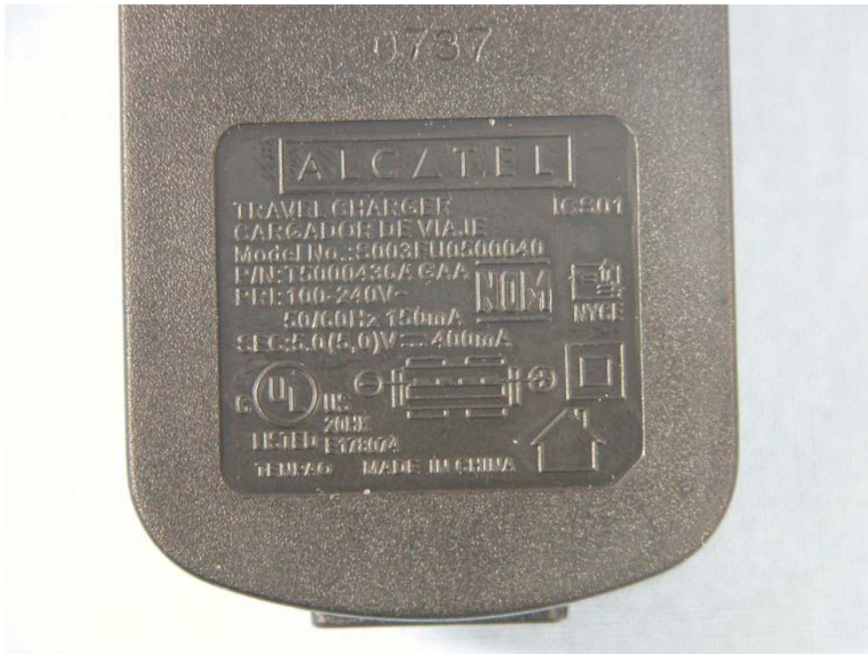
Label of Charger (AC/DC Adapter)