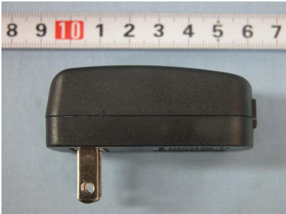
Charger (AC/DC Adapter)