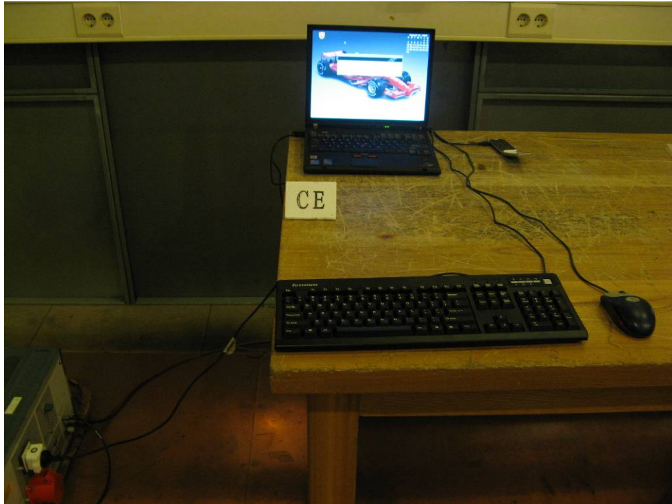
Pic 3 Part 15B Conducted Emission with laptop