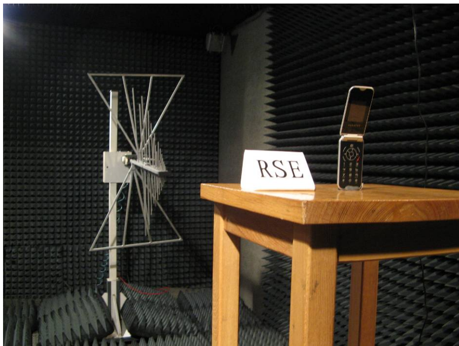
Pic 2 Part 2224 Radiated Spurious Emission