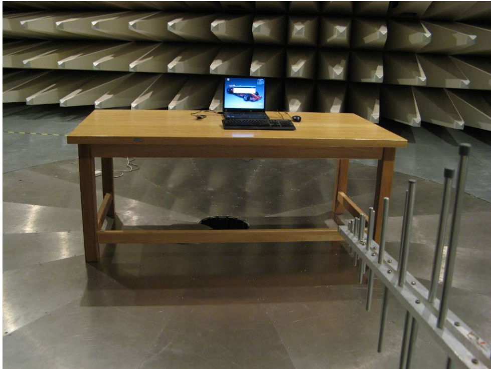
Pic 5 Part 15B Radiated Spurious Emission