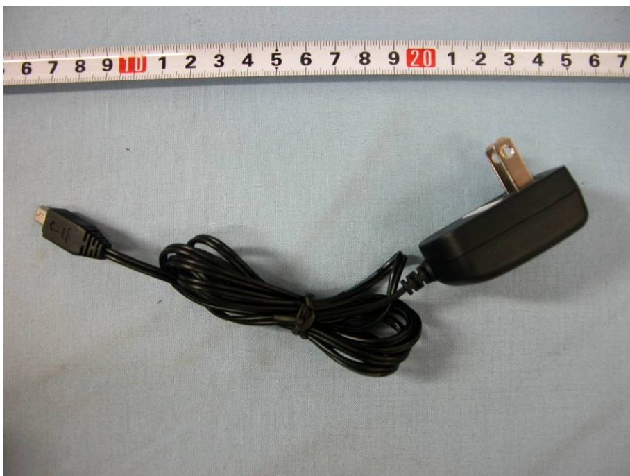
Charger (AC/DC Adapter)