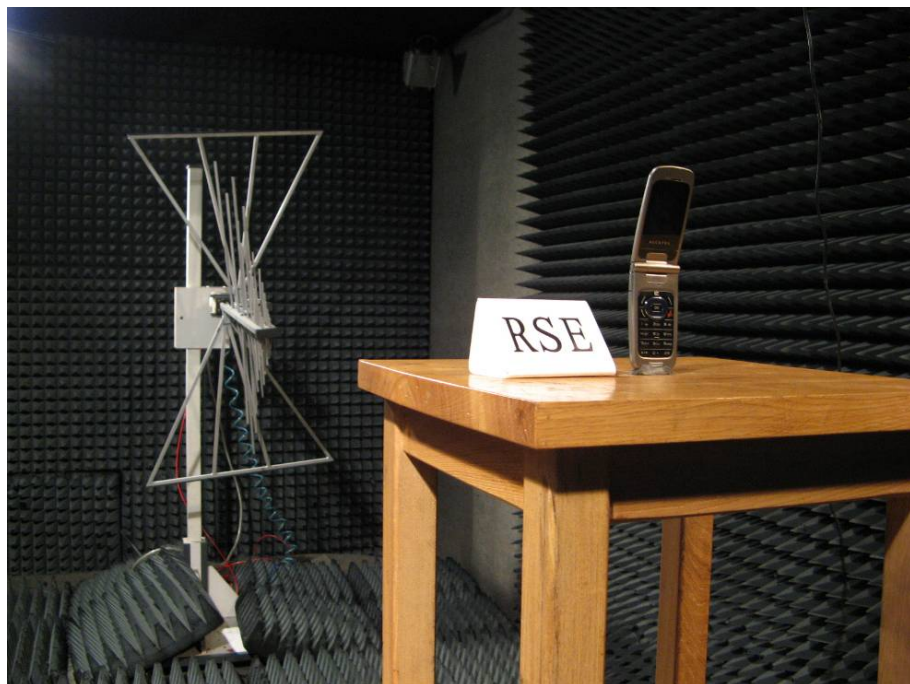
Pic 2 Part 22 24 Radiated Spurious Emission