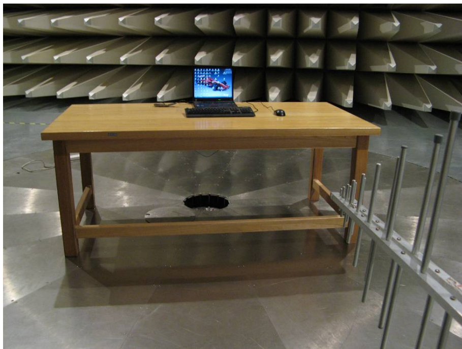
Pic 4 Part 15B Radiated Spurious Emission