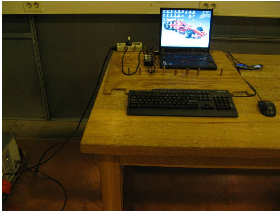
Pic 3 Part 15B Conducted Emission