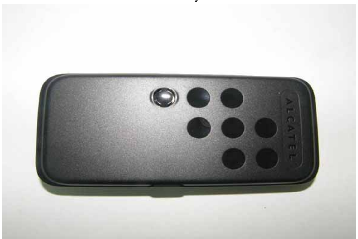
Left View of EUT