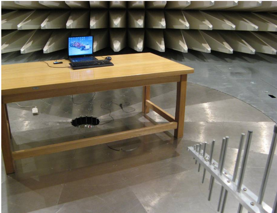
Pic 4 Part 15B Radiated Spurious Emission