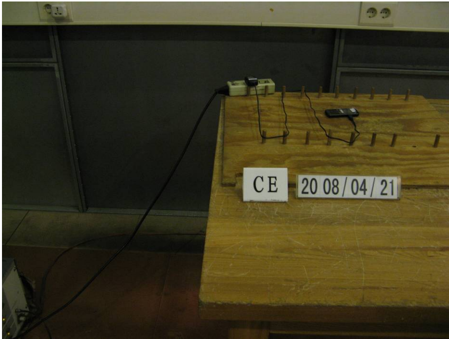
Pic 1 Part 22 24 Conducted Emission