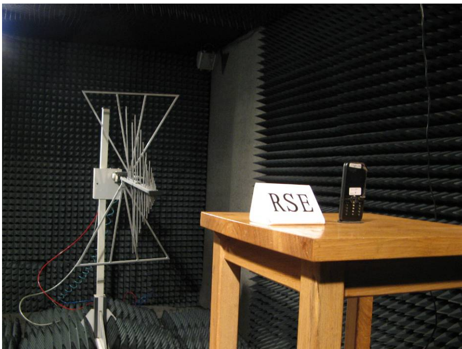
Pic 2 Part 22 24 Radiated Spurious Emission