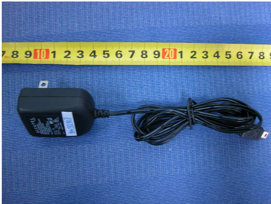
Charger (AC/DC Adapter)