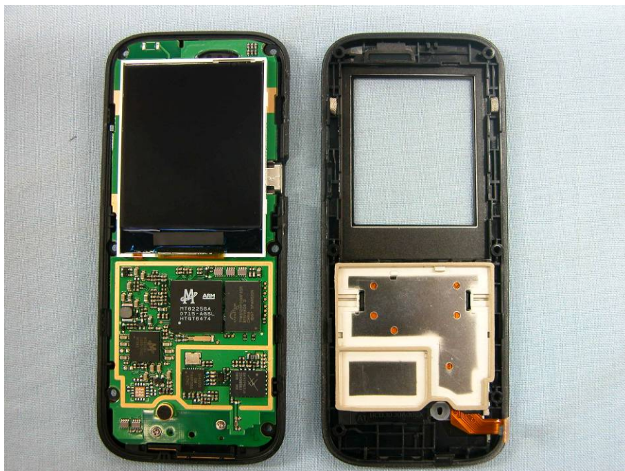
Mobile phone Disassembly