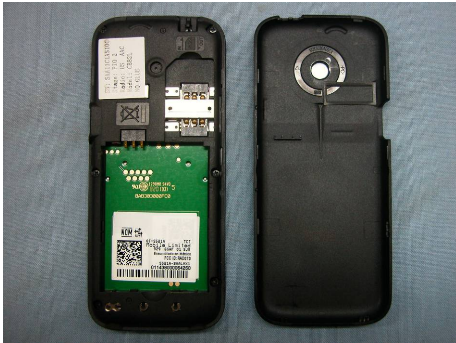
Mobile phone Disassembly