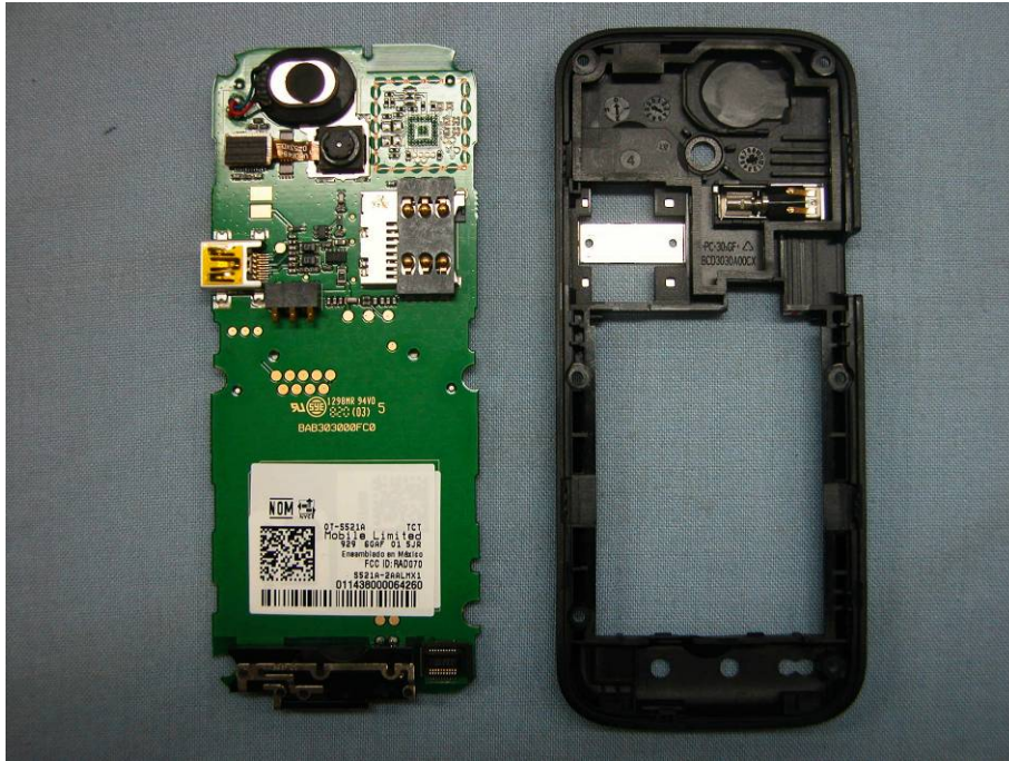
Mobile phone Disassembly