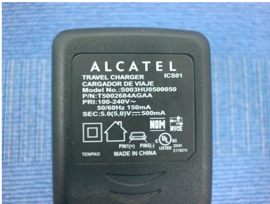
Label of Charger (AC/DC Adapter)