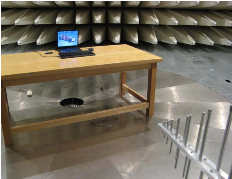
Pic C.1 Radiated Emission