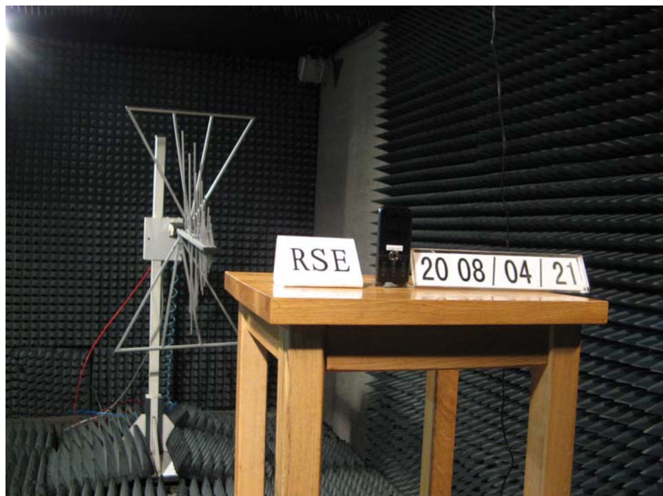
Pic2 Radiated Spurious Emission