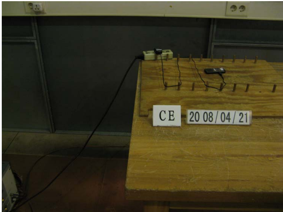
Pic1 Conducted Emission