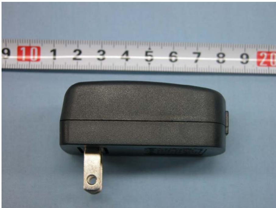
Charger (AC/DC Adapter)