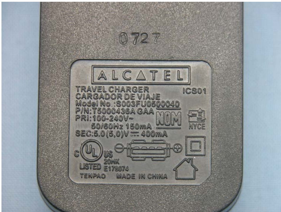
Label of Charger (AC/DC Adapter)