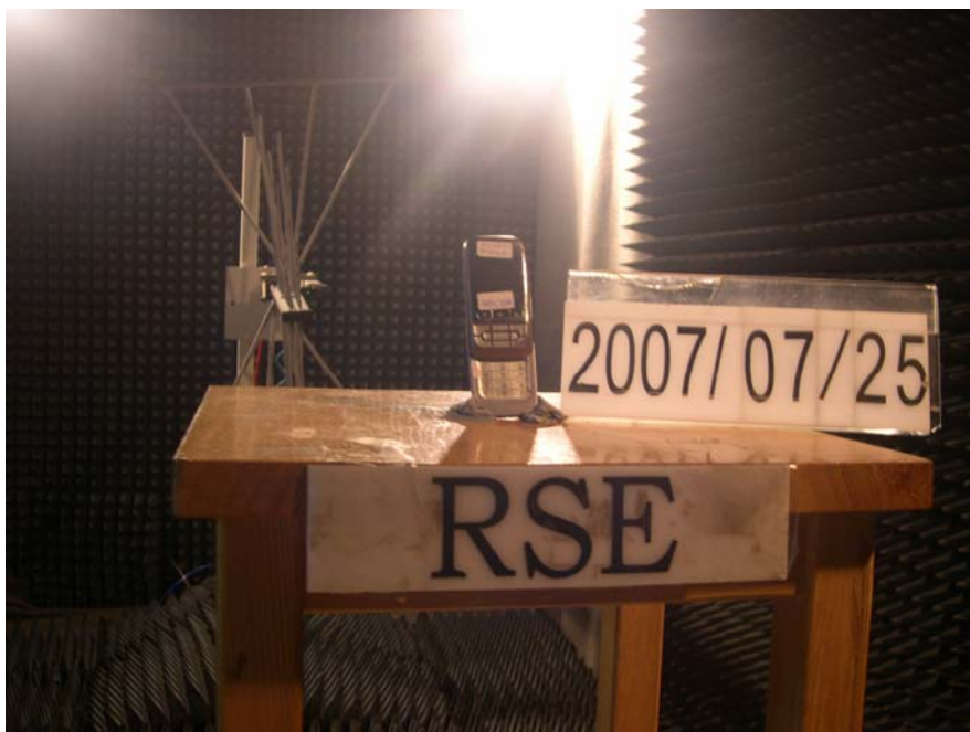
Pic2 Radiated Spurious Emission