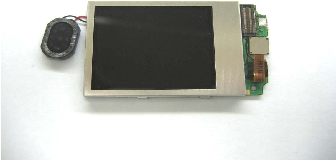
Internal of EUT - 5