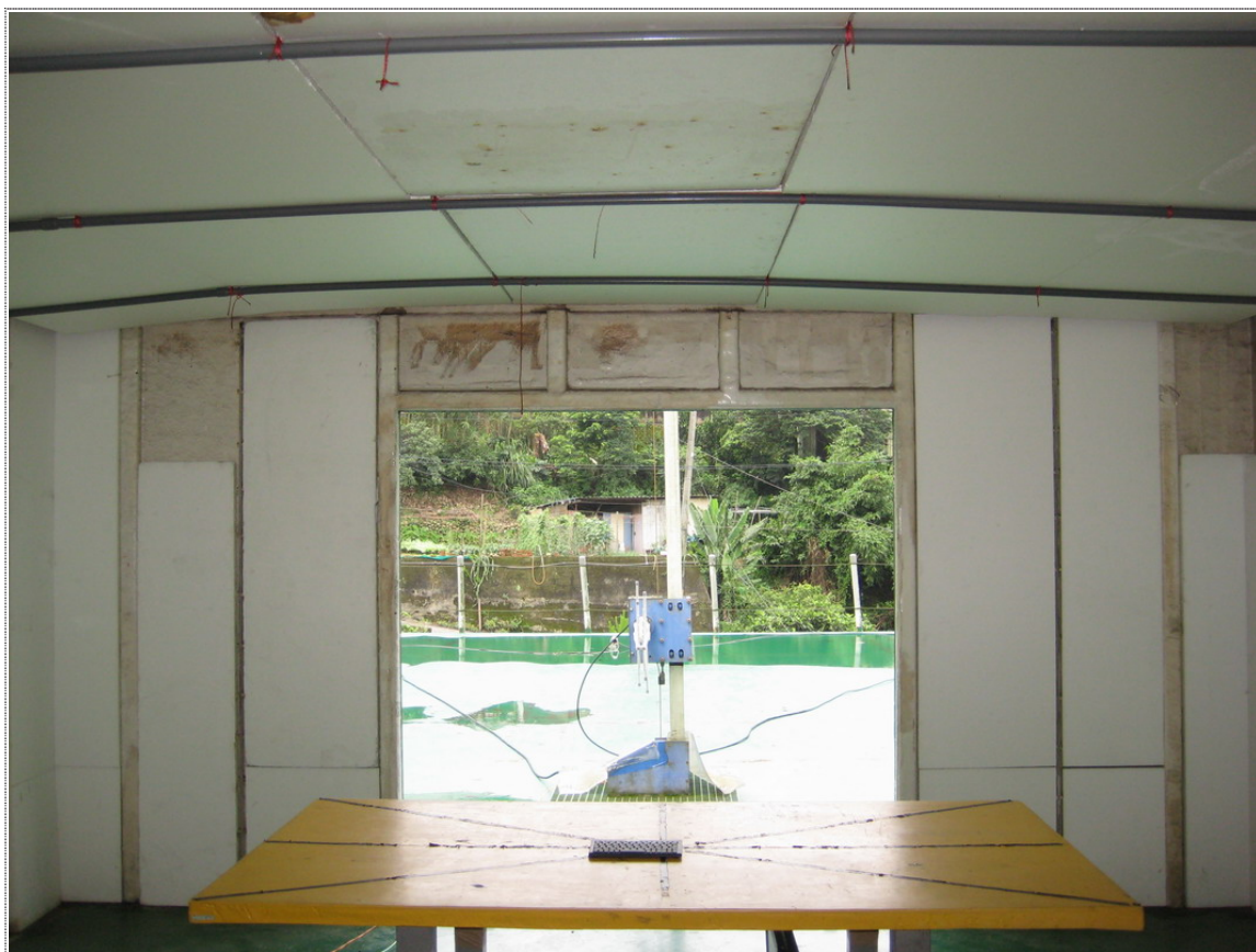
Front View (Frequency below 1GHz)