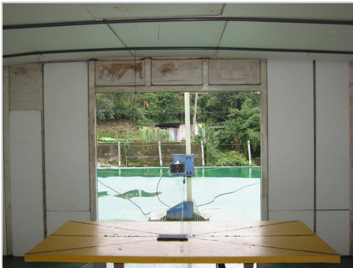
Front View (Frequency above 1GHz)