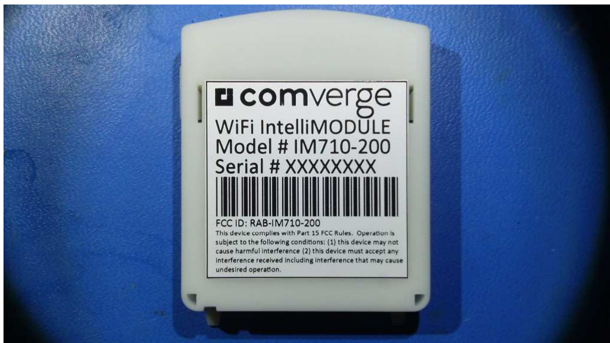
Figure 2: Label Placement