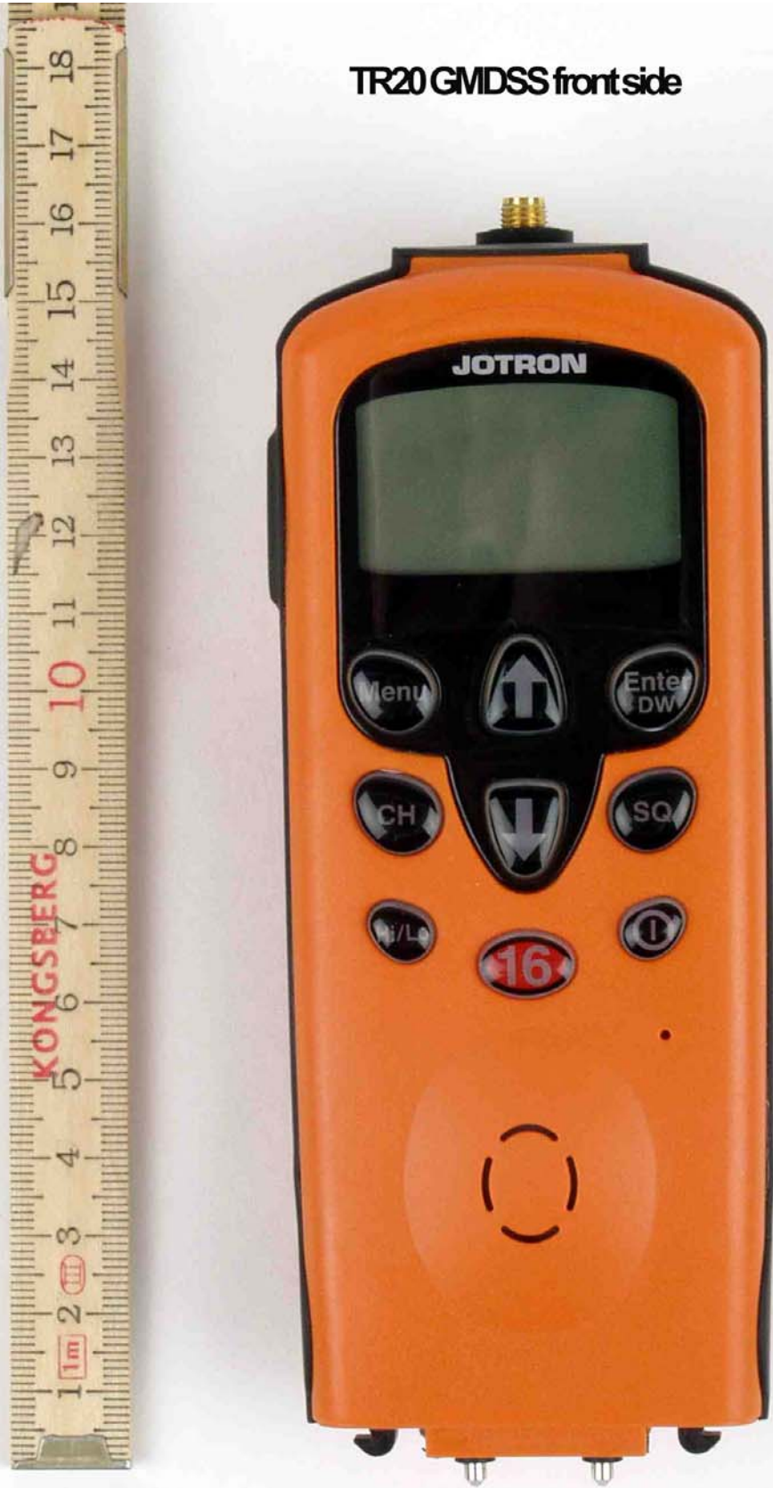
TR20 GMDSS front side