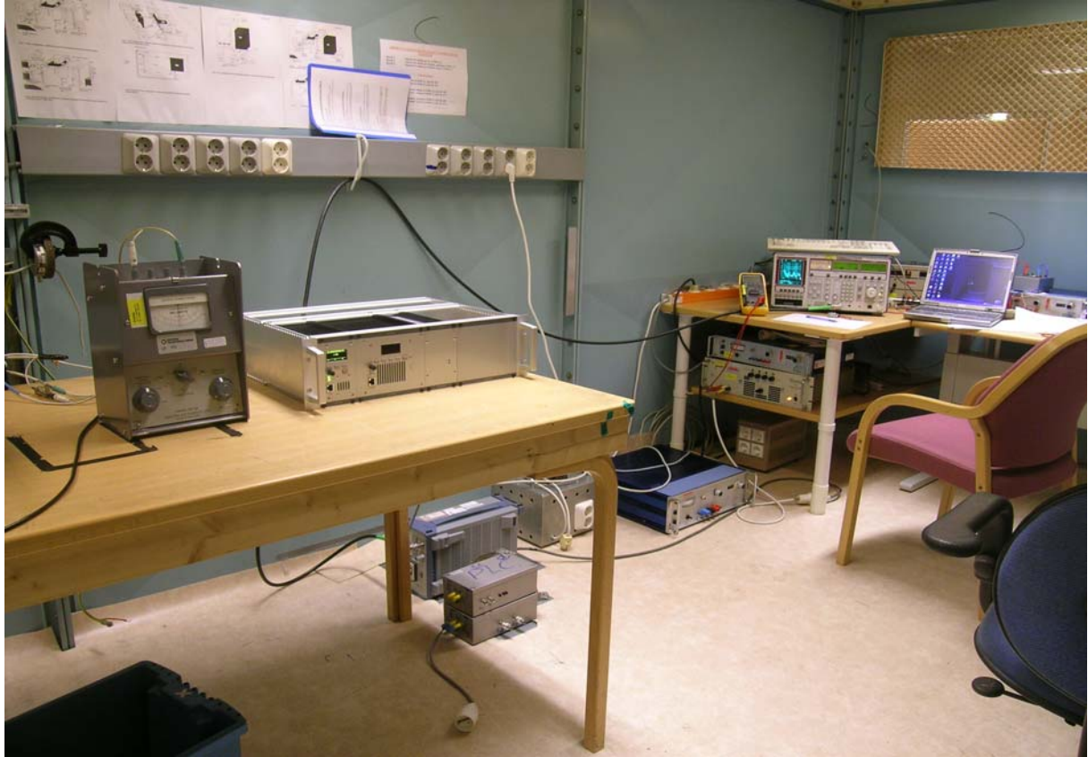
Conducted emission 150kHz – 30MHz , AC/DC mains