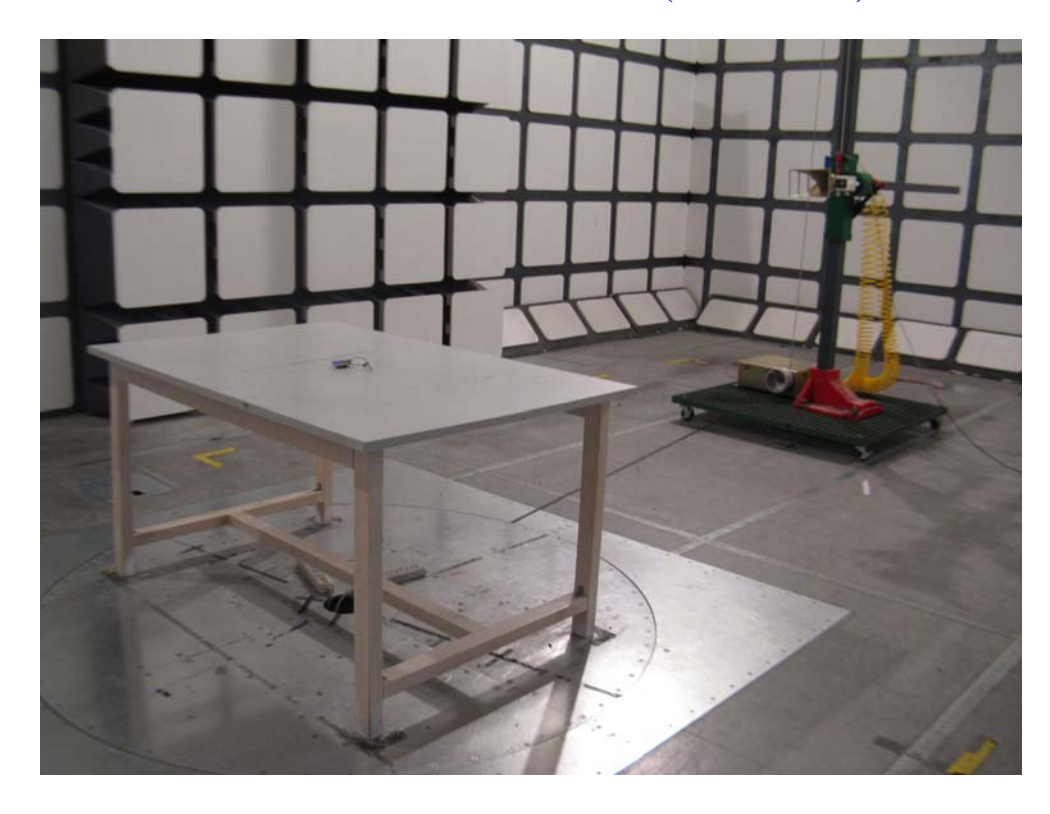
Radiated\ Emissions - Rear\ View\ (Above\ 1\ GHz)