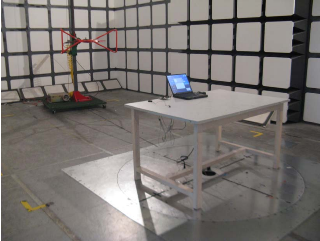
Transmitting mode: Radiated Emissions - Rear View (30 – 1000 MHz)