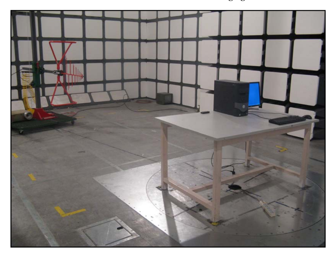
Radiated Emissions - Rear View for charging mode