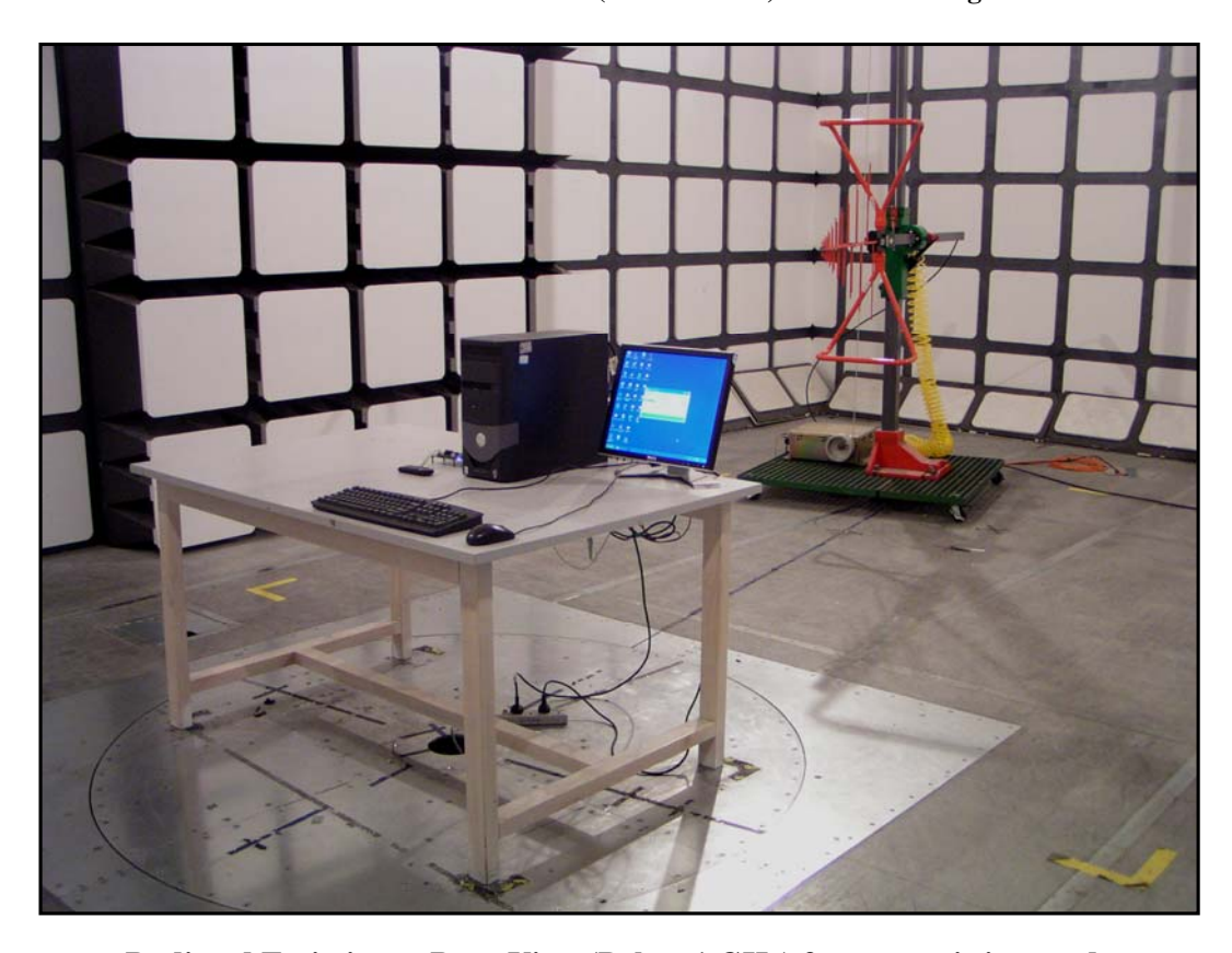
Radiated Emissions - Rear View (Below 1 GHz) for transmitting mode