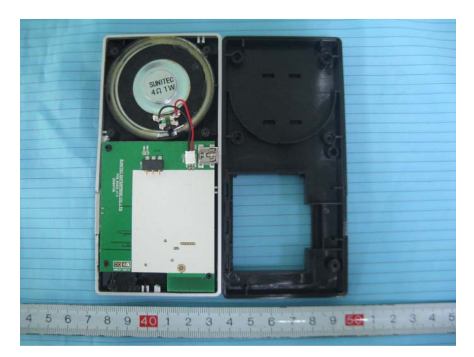
EUT – Unbuttered-covered View