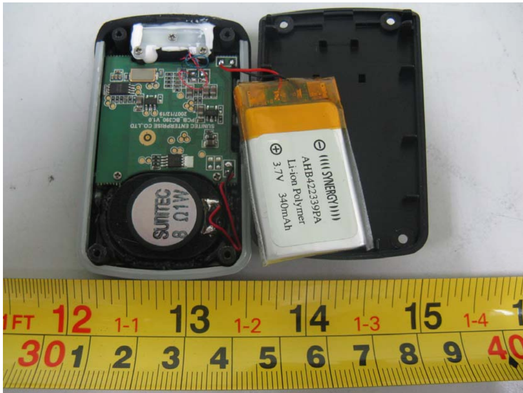
EUT- Main Board Top Components View