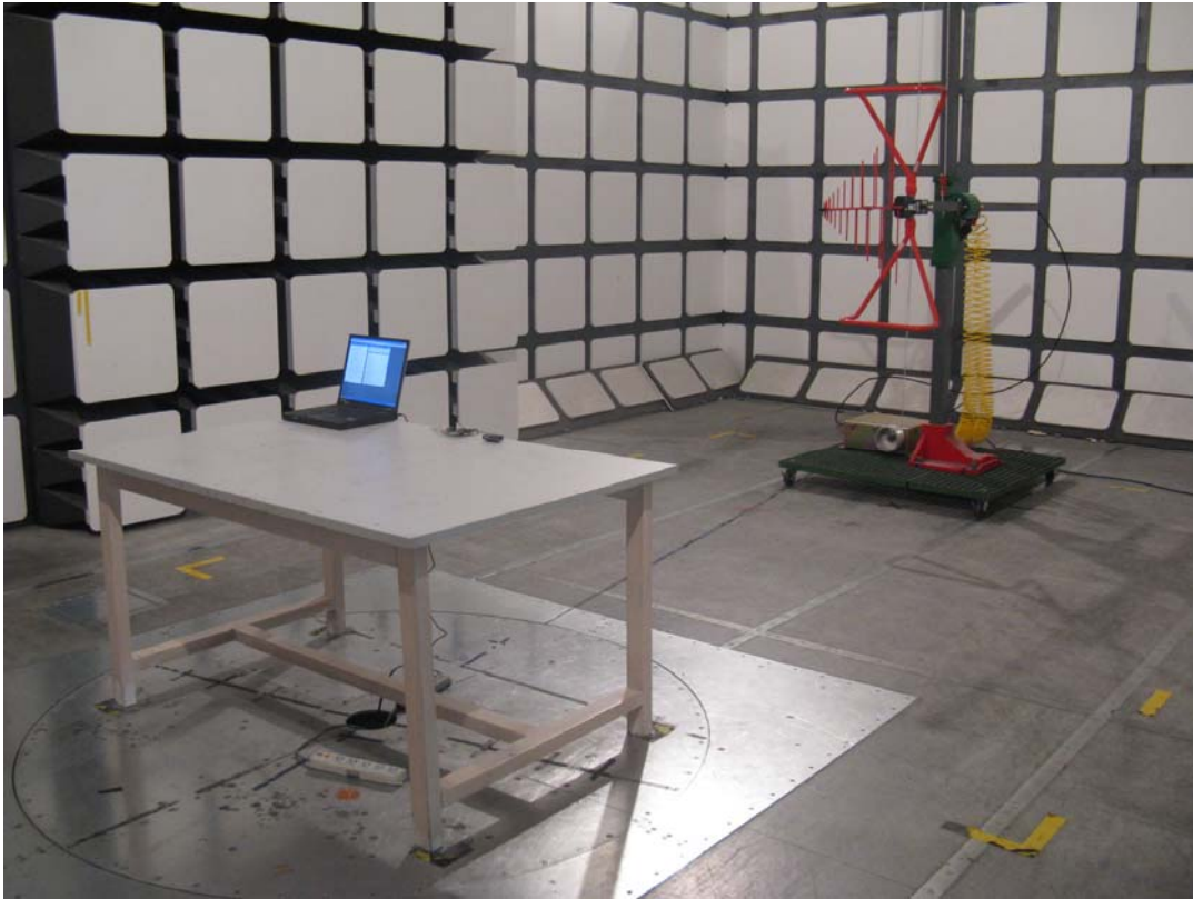
Radiated Emissions - Rear View (30 -1000 MHz)