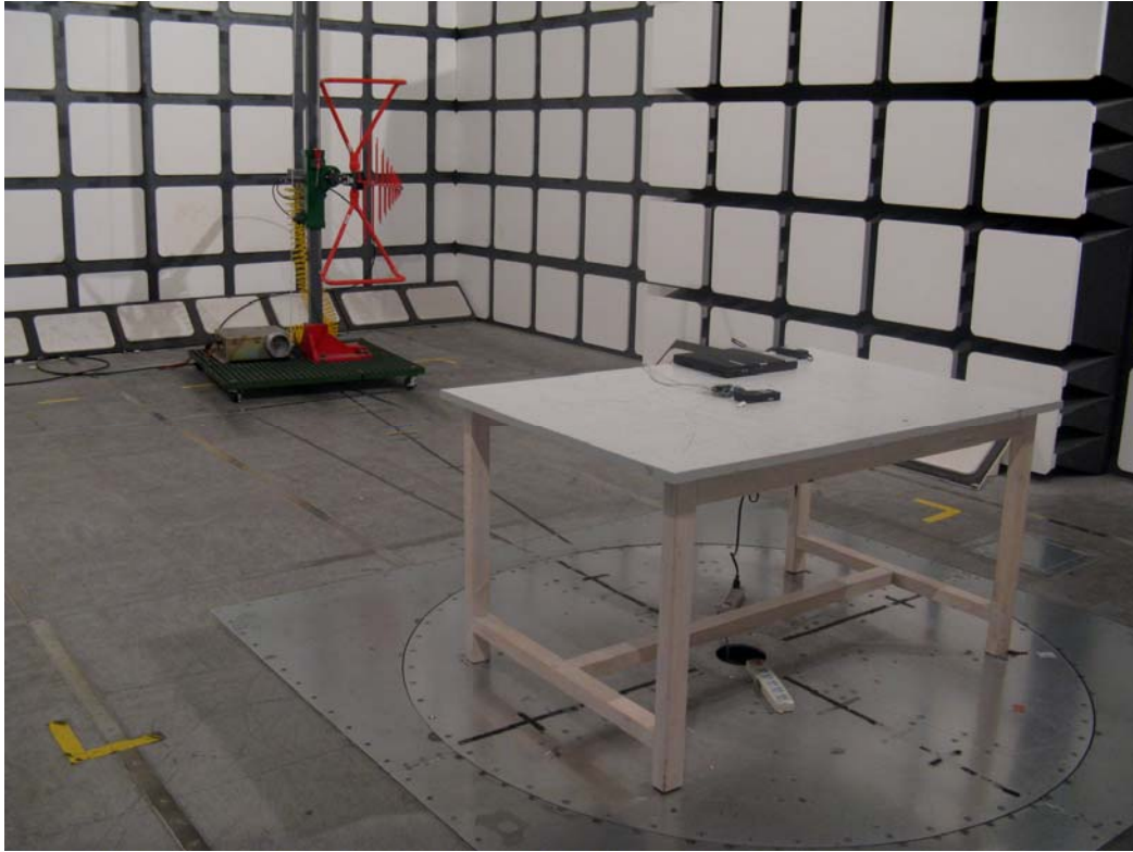
Radiated Emissions - Rear View (30 -1000 MHz)