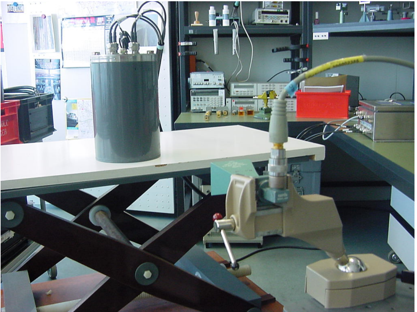
Test set-up for field strength measurements up to 25 GHz