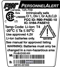
as printed at 100% with barcodes serial and order numbers