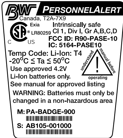
Label Artwork @ 200%