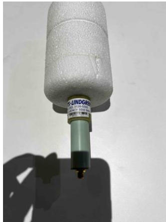
Fig 2 model 3126-5500 frequency 5500 MHz