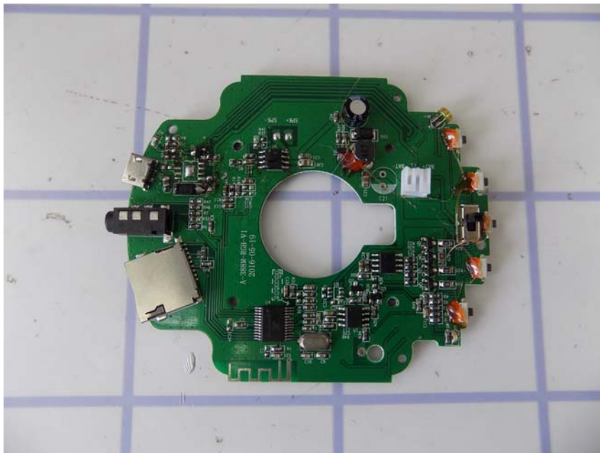
PCB side 1 view

Copyright of this report is owned by Centre of Testing Service and may not be reproduced other than in full except with the written approval of the issuing Company.