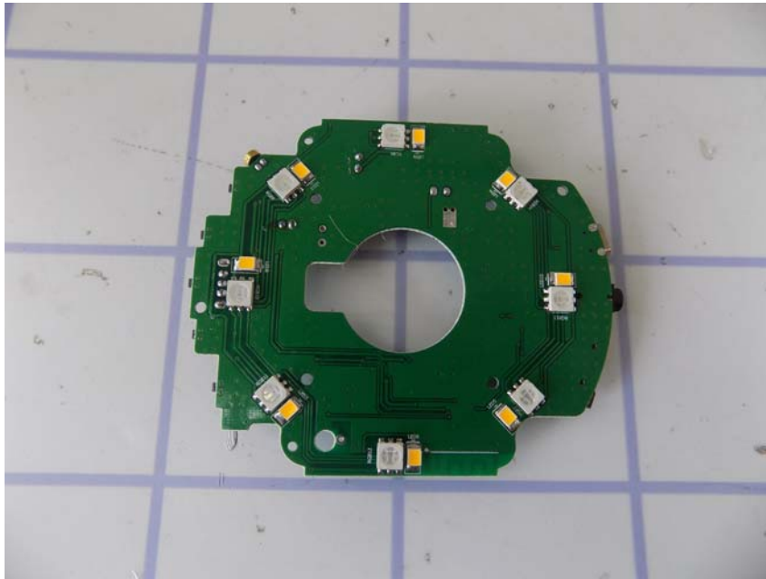
PCB side 2 view