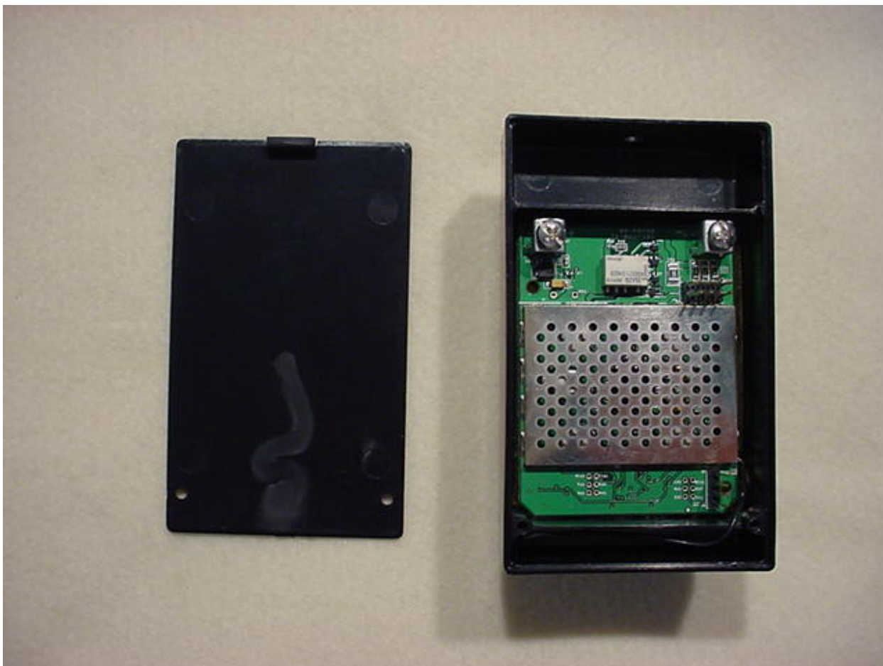
Figure 1: EUT – Interior View