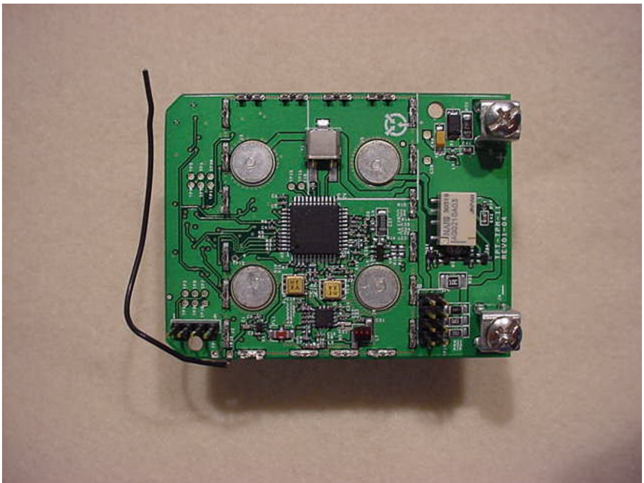
Figure 3: EUT – Bottom PCB without RF Cover