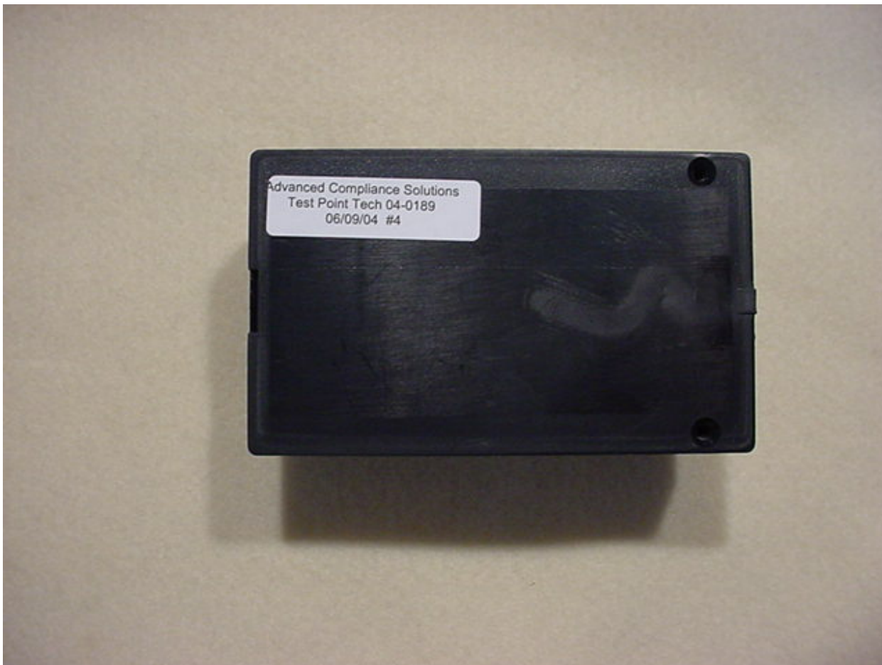
Figure 2: EUT – Bottom Exterior View