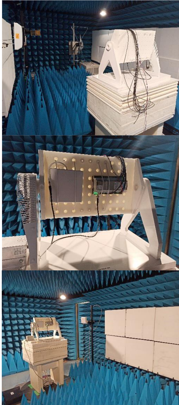
Anechoic chamber (Z axis)

Maximum output power and unwanted emissions in restricted frequency bands: