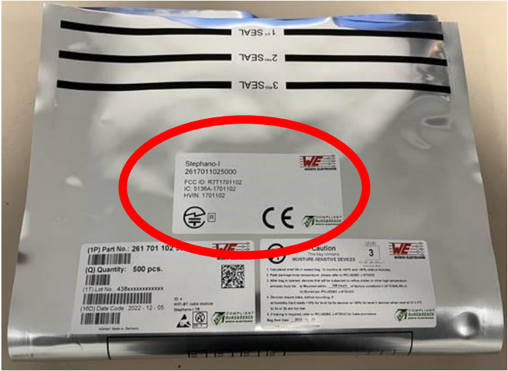
Placement of the packaging label

The font size used, is 2.5pt and thus smaller than 4pt (~1.27mm). The ISED and MIC number do not fit to the label due to the small size. It is part of the user manual and part of the label of the packaging.