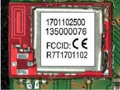
Placement of the module label

The Stephano-I label has the size of 6.3x6.3mm. It contains parts of its article number “1701102500” or “1701142500” and the serial number of the entity (135000076) and the FCC ID. The 1701102 is the HVIN. The label is placed on the shielding of the radio module.