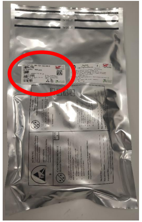
Placement of the packaging label

The font size used, is 2.5pt and thus smaller than 4pt (~1.27mm). The CE logo, as well as FCCID and ISED do not fit to the label due to the small size. It is part of the user manual and part of the label of the packaging.