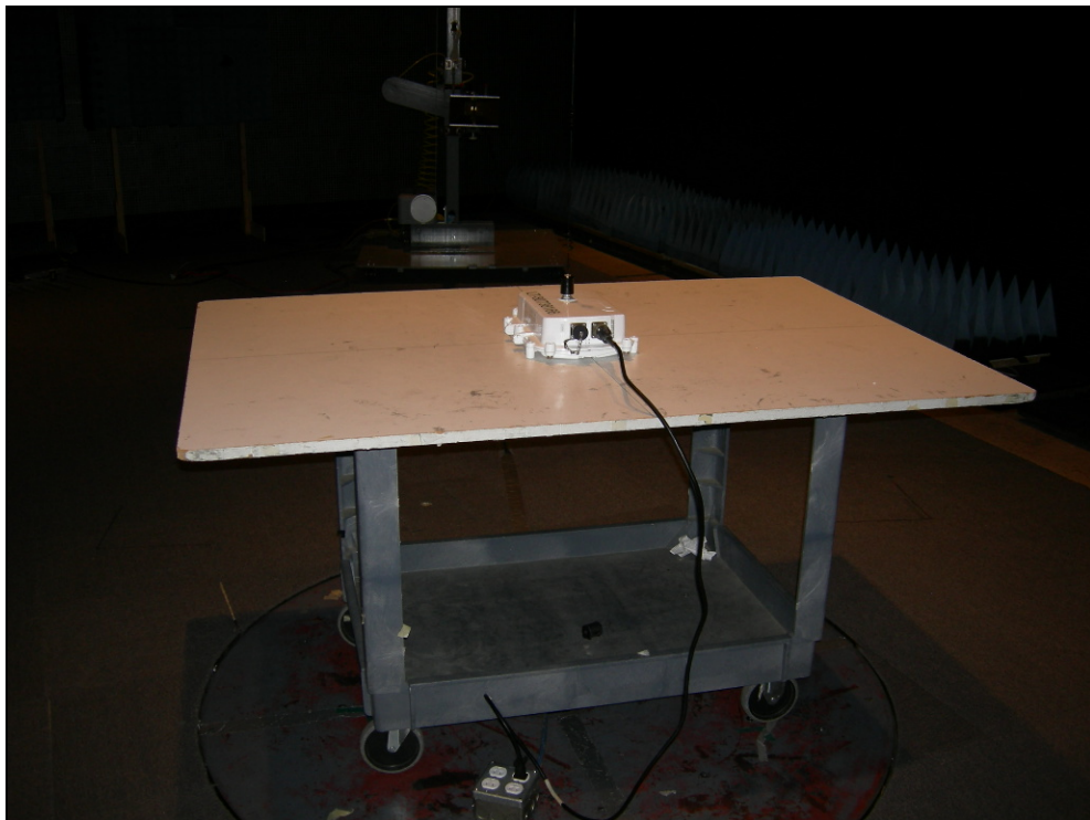
Figure 2: Radiated Emissions