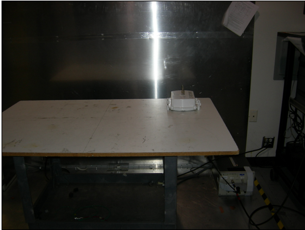
Figure 3: Conducted Emissions