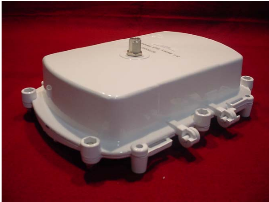
Figure 2: Exterior View