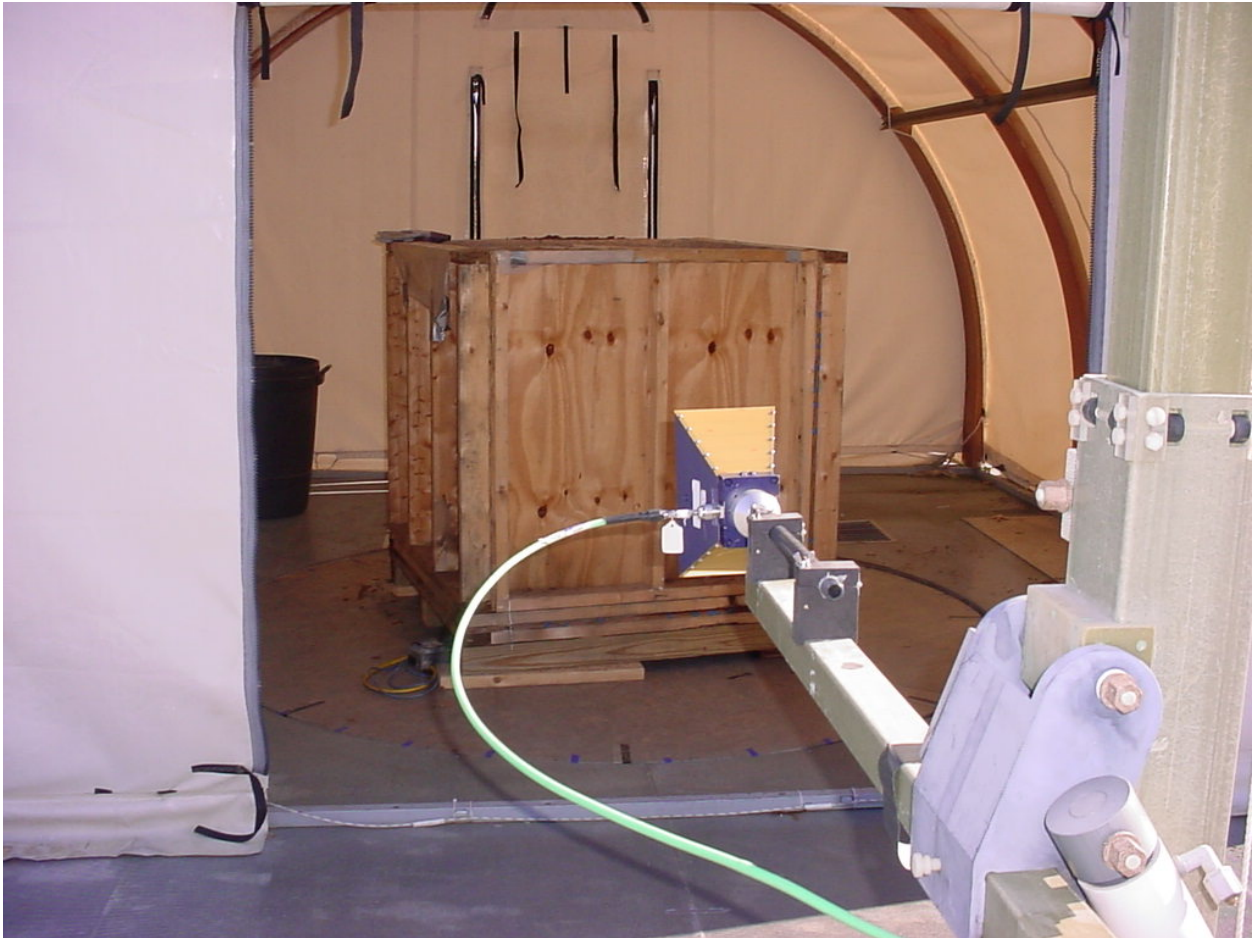
Figure 1: Test Setup – Radiated Emissions (Intentional – Wood Test Fixture Exterior)