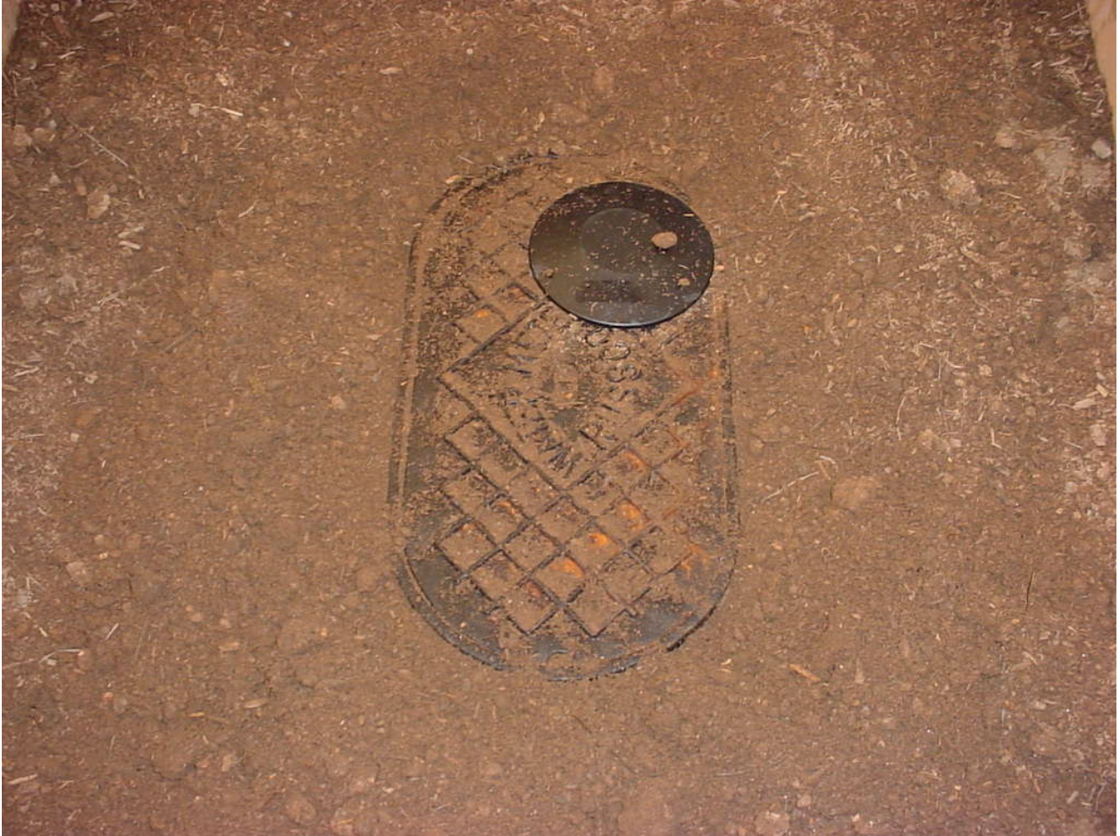
Figure 3: Test Setup – Radiated Emissions (Intentional – Cast Iron Meter Box)