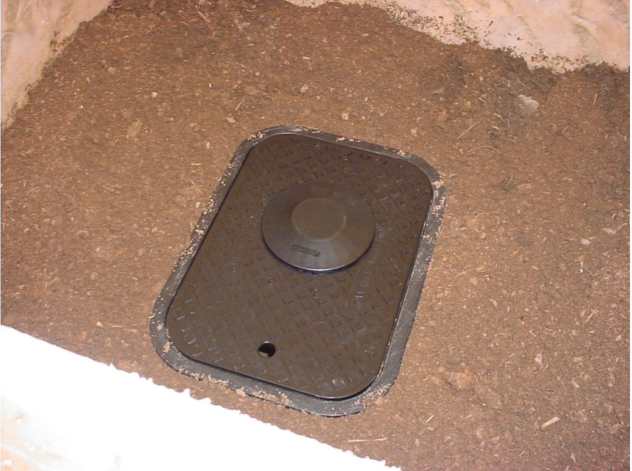
Figure 1: Test Setup – Radiated Emissions (Intentional – Composite Meter Box)