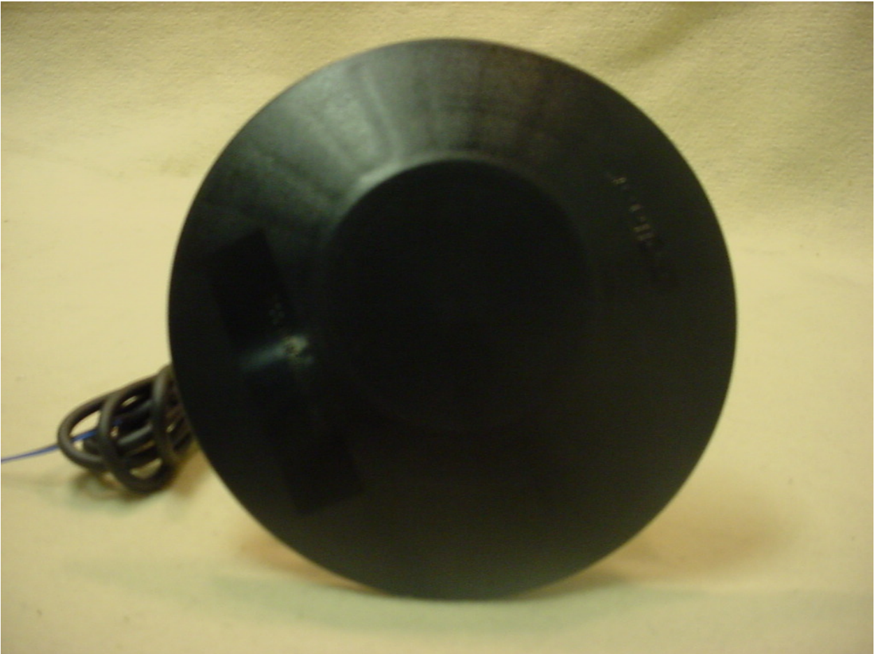
Figure 1: External – Top View