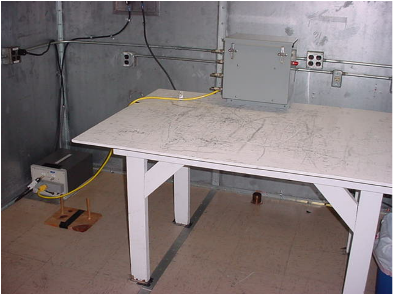
Figure 2: Conducted Emissions