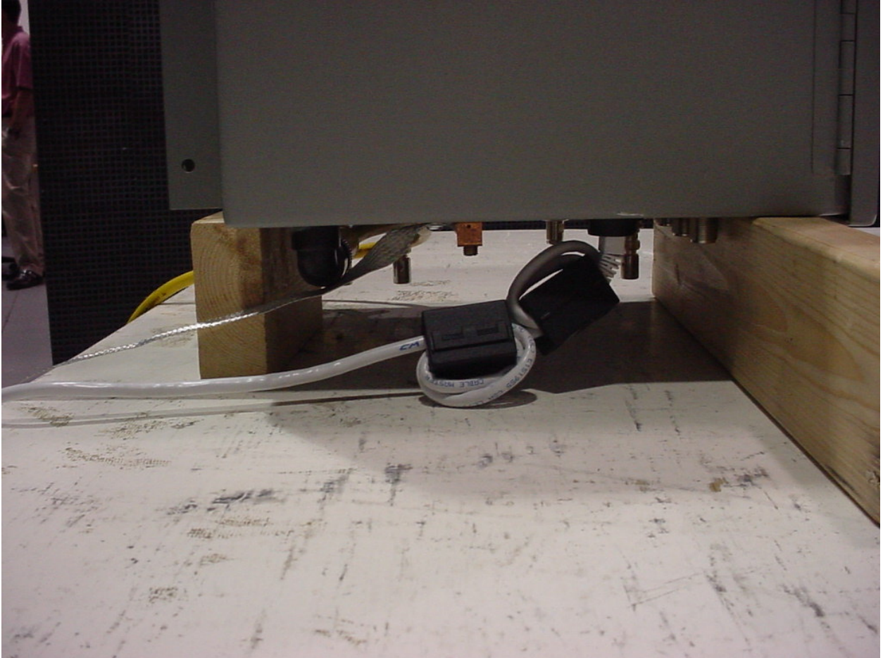
Figure 2: Shielded external Ethernet cable with two Steward brand ferrites, 28A5776-0A2, with three turns each. Both ferrites were situated close to the EUT Ethernet connector.