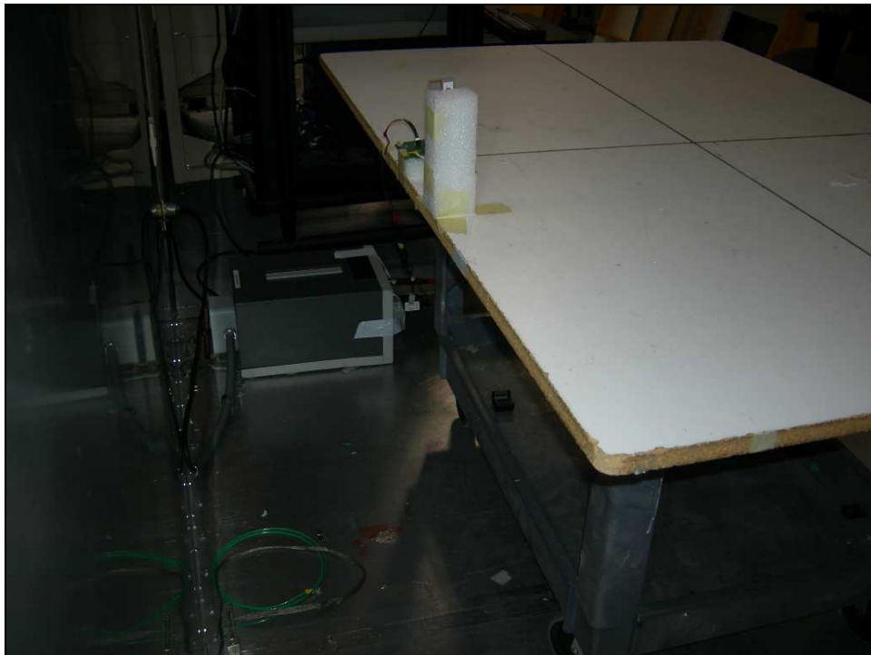
Figure 5: Conducted Emissions