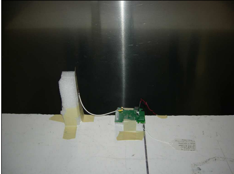
Figure 4: Conducted Emissions