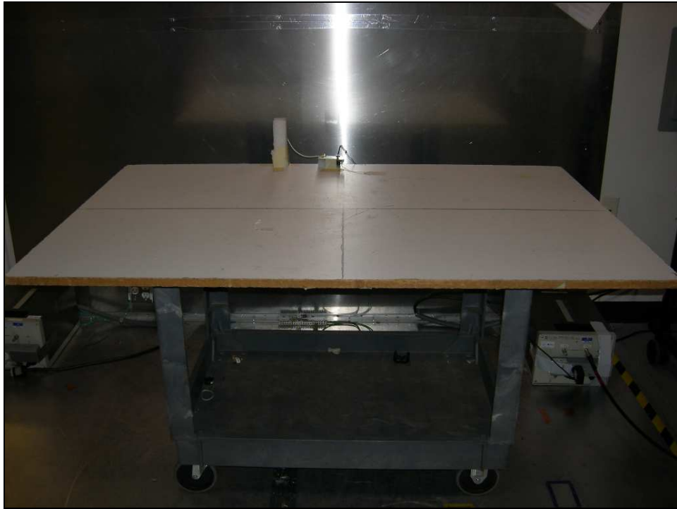
Figure 3: Conducted Emissions