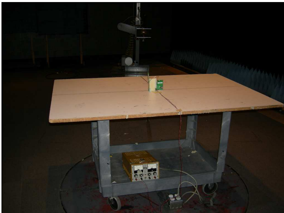
Figure 2: Radiated Emissions