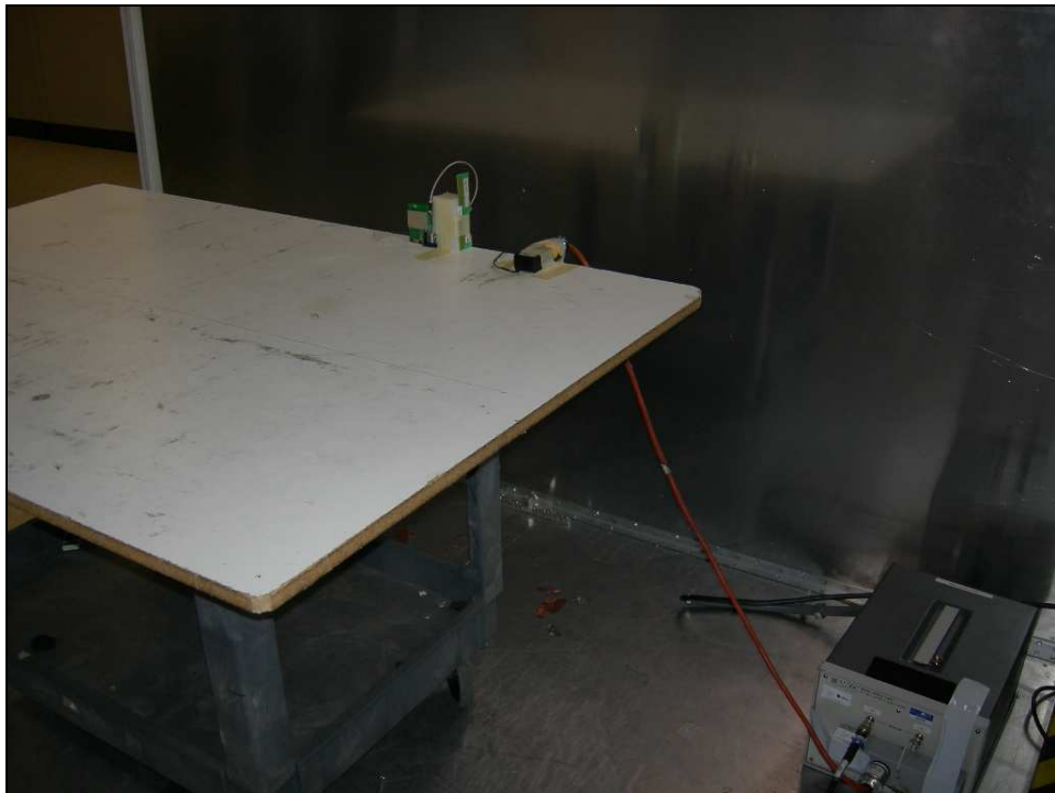
Figure 3: Conducted Emissions