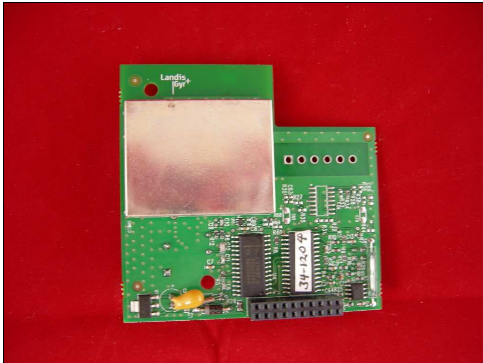
Figure 1: External Photo