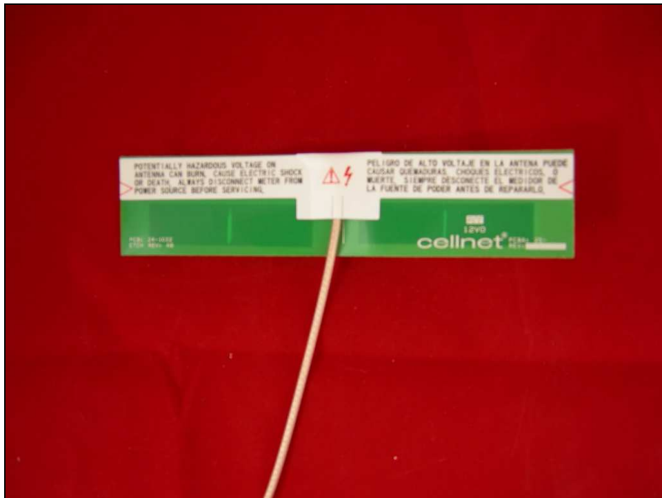
Figure 3: External Photo – Antenna