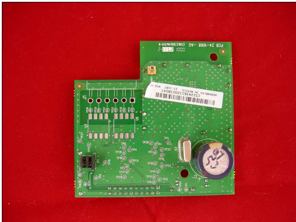
Figure 2: External Photo