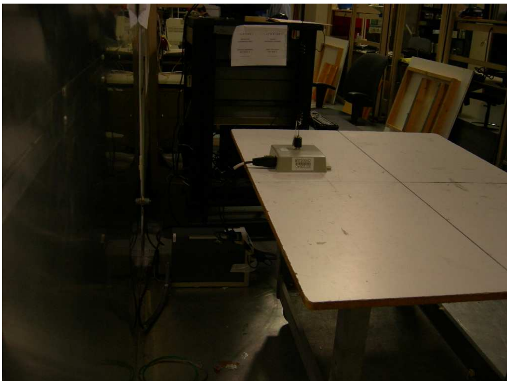
Figure 4: AC Powerline