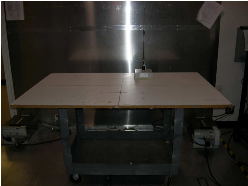
Figure 3: AC Powerline