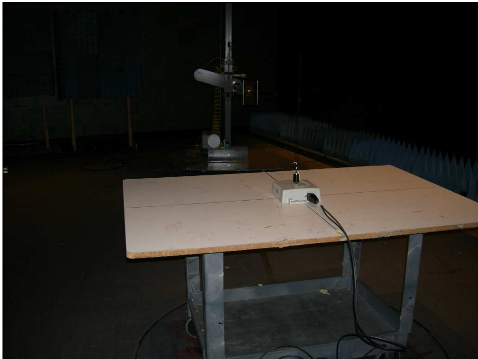
Figure 2: Radiated Emissions