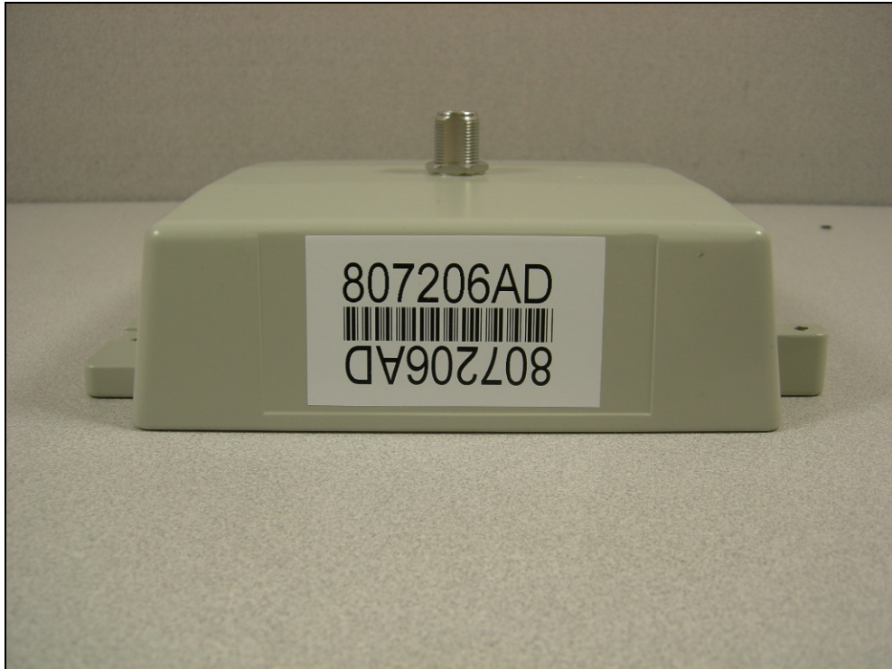
Figure 5: External Photo – Side