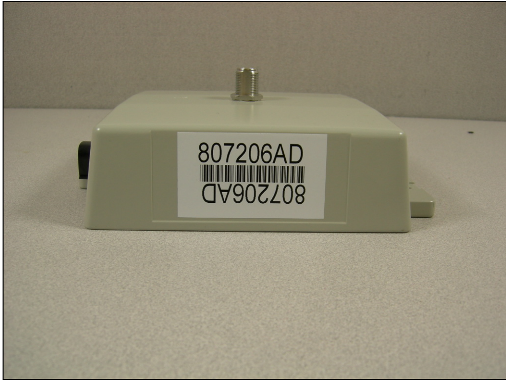
Figure 3: External Photo – Side