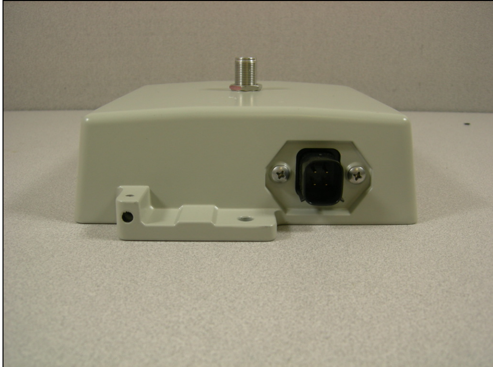
Figure 4: External Photo – Front