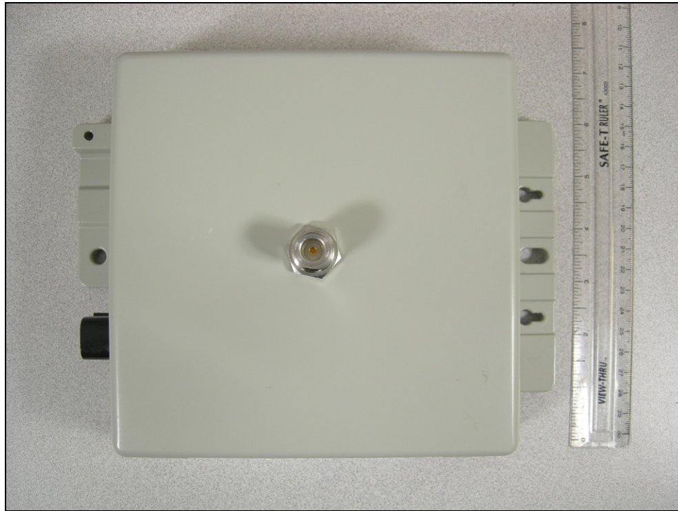
Figure 1: External Photo – Top