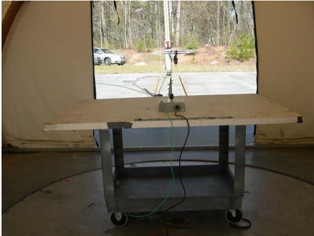
Figure 3: Radiated Emissions - Unintentional