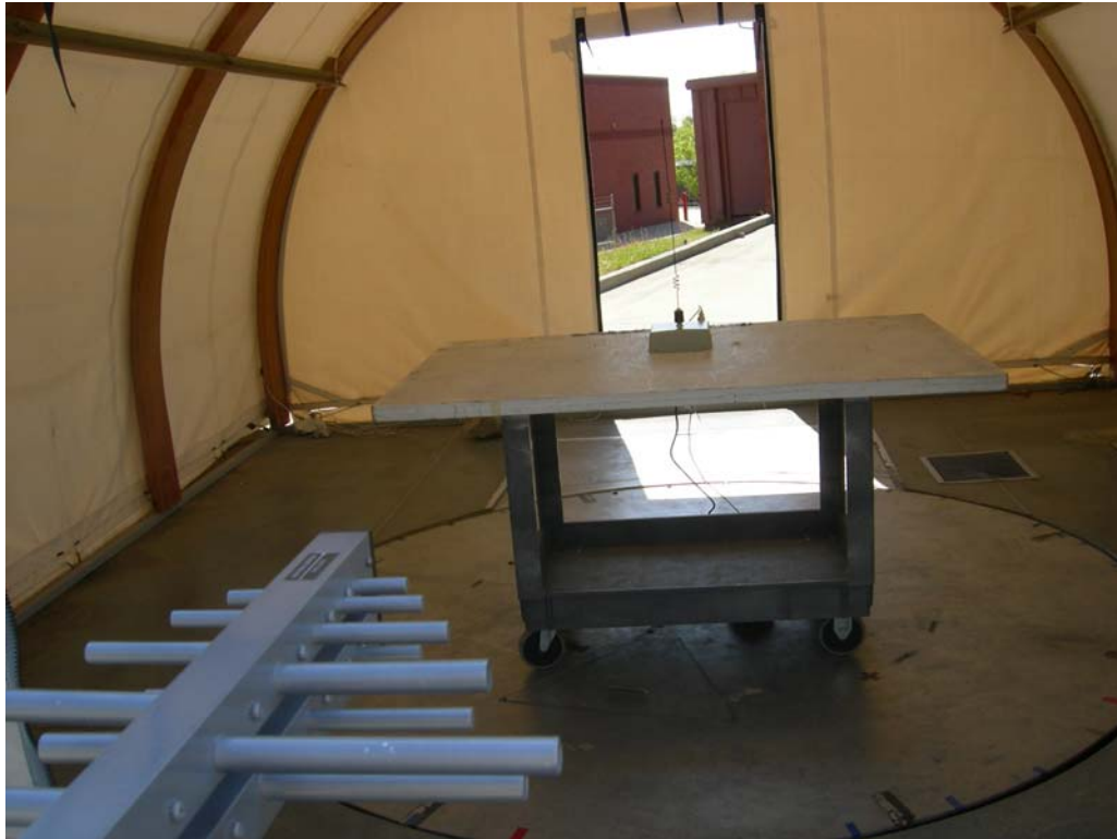
Figure 4: Radiated Emissions - Unintentional