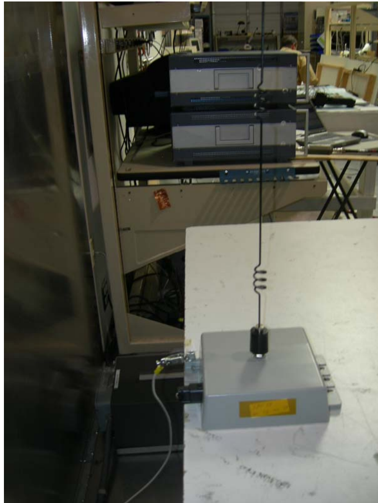
Figure 2: AC Power Line Conducted Emissions