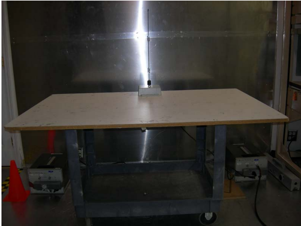
Figure 1: AC Power Line Conducted Emissions