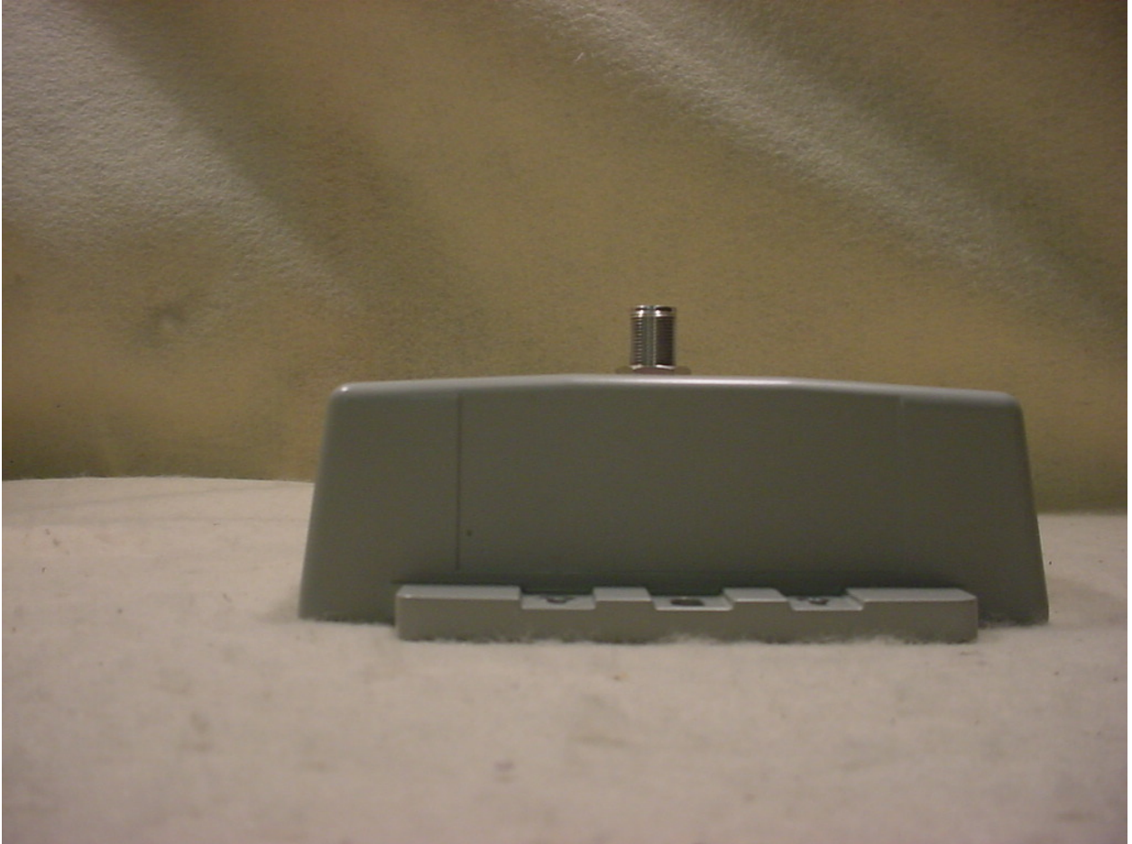
Figure 5: Side View