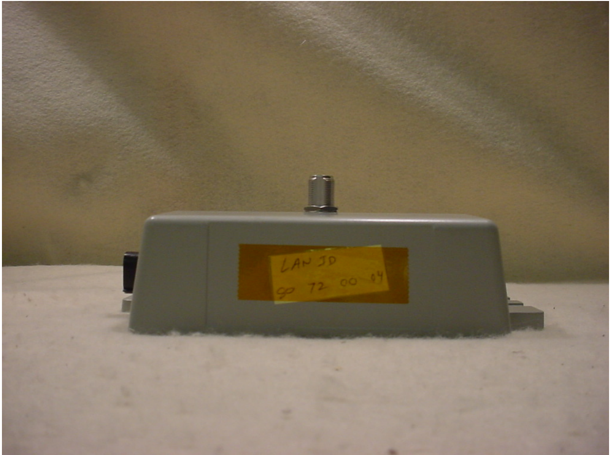
Figure 4: Side View