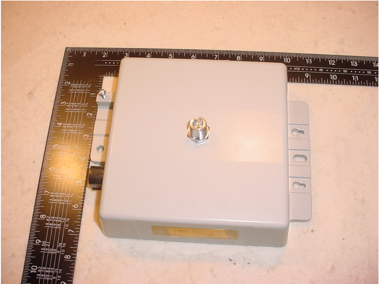
Figure 1: Top View