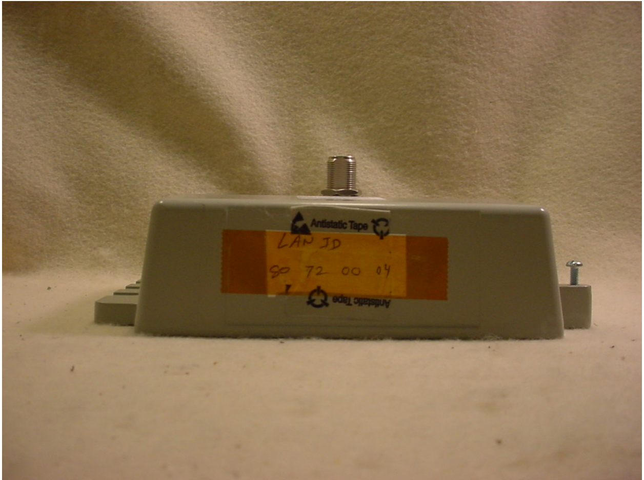
Figure 6: Side View