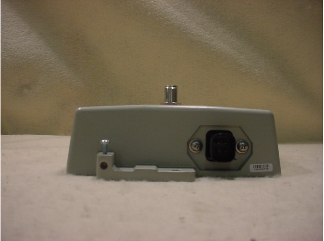
Figure 3: Side View